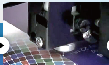
Creasing & Cutting