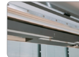
CCD visual positioning system(Optional) Cylinder printing mode